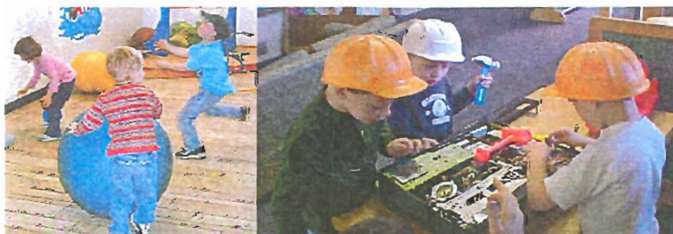
A safe play-and-learn environment - fundamental to early childhood development

Education in Provost doesn't end at high school. Provost & District Adult Learning & Literacy is comprised of five programs; Adult Learning, Adult Literacy, Rural Innovations Access Program, Career & Employment Assistance Services, and a CAP Site (Computer Access Program). The Provost program is equipped with state-of-the-art video-conferencing equipment and offers distance and on-line learning from universities and colleges.