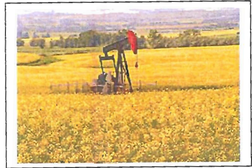
Agriculture and energy - cornerstones of the Provost economy

Provost's service clubs and volunteer groups have a long tradition of supporting the best interests of area residents. That support will be demonstrated again in the development of the Provost Regional Activity Centre . The local business sector and broader regional corporate community will also be asked to join the community partnership and contribute to a successful completion of this project. Their support will be indispensable.