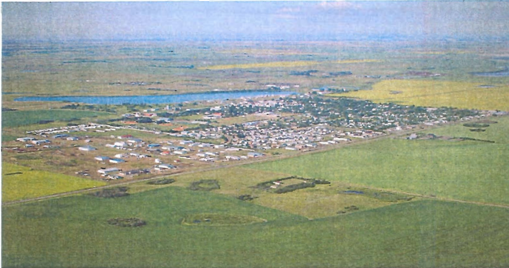
Provost serves an expansive agricultural community and one of Canada's largest oilfields