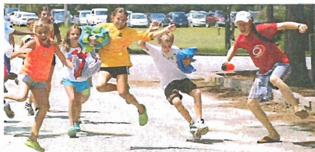
Heading for the pool on a warm summer day

Healthcare services in Provost are second to none in east central Alberta. A team of physicians serve the region from a modern community clinic. A state-of-the-art dental facility is linked with the medical clinic with a second dental facility located downtown one block off of Main Street. Provost Health Centre features an acute-care hospital and nursing home as well as assisted living units. Maternity service, minor surgery, and palliative care are available to Provost area residents. Seniors in the Provost region can choose from a full range of accommodations and services. Regional residents from infants to the elderly are supported by an extensive array of services provided through Provost and District Family and Community Support Services .