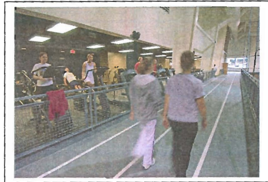
Expanding opportunities to participate