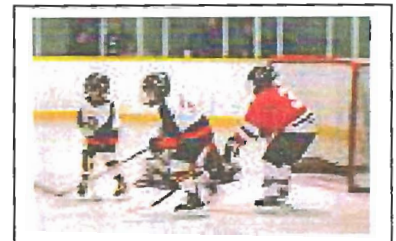
Building for generations to come

Provost & Dist Ag Society, Bodo Oilers, Provost & Dist FCSS, Provost Minor Ball, Provost Ec. Development Committee, Provost & Dist Adult Learning & Literacy, MTM Hockey Club, Provost Mun. Library, Provost Recreation Board, Provost & Dist Health Services Foundation, Provost Oldtimer Hockey, Provost & Area KidSport Society, Provost Ladies Basketball, Provost Girl Guides-Brownies, Provost Walking Path Committee, Provost Mixed Slo-Pitch, Provost Jets Hockey, Provost & Dist Fish and Game, M & J Devils Hockey, Cadogan Nitehawks Baseball, Provost & Dist Golf Club, Provost & Dist Chamber of Commerce.