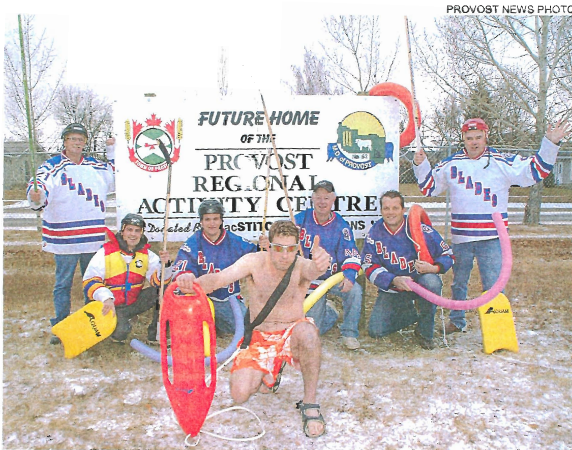
New year-round opportunities for a diverse range of residents in the Provost region

Operational costs for the Activity Centre were also assessed. The Task Force recognized that some energy cost increases will be experienced in future years, but calculated that they will be offset by newly incorporated energy efficiencies. The Town of Provost has been a prudent and effective recreation facilities manager for several decades.