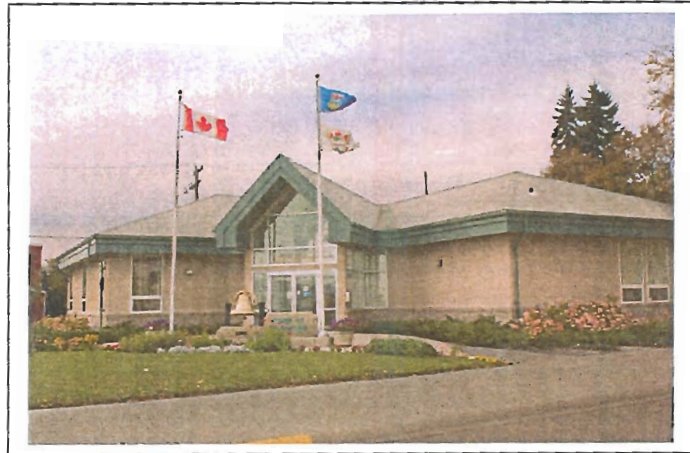
Town of Provost Municipal Office

20 km. west of the Saskatchewan border, the Town of Provost lies in the Municipal District of Provost at the crossroads of Alberta Hwy. No.13 and several secondary highways. Provost is the principle service centre for an expansive surrounding area. Rail service and 5,000 feet of local airport runway complement Provost's transportation capacity.